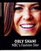
ORLY SHANI NBC's Fashion Star