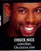
CHUCK NICE comedian, ChuckNice.com