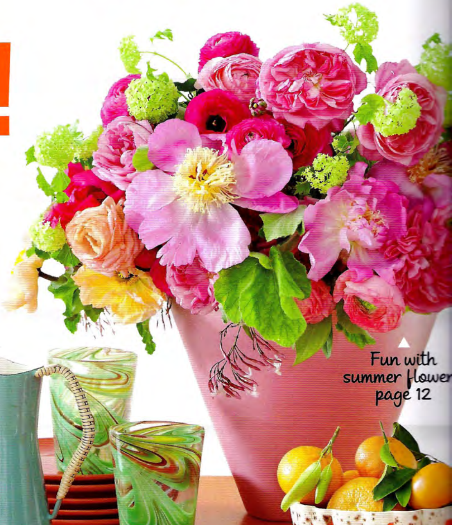
Fun with summer flowers page 12