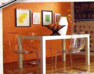
The Color Pizzazz collection will make your interior space pop.