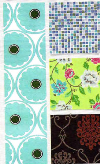
These HGTV HOME by Sherwin-Williams wallpapers and decals are so fierce they're like wall art.

For fresh new ways to paint, visit sherwin-williams.com/hgtvhome