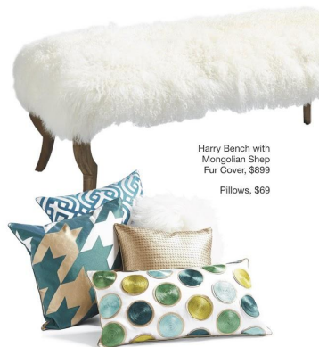
Harry Bench with Mongolian Sheep Fur Cover, $699 Pillows, $69