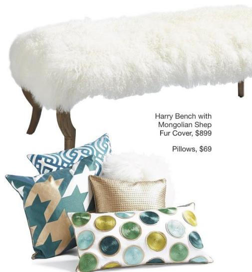
Harry Bench with Mongolian Sheep Fur Cover, $899 Pillows, $69