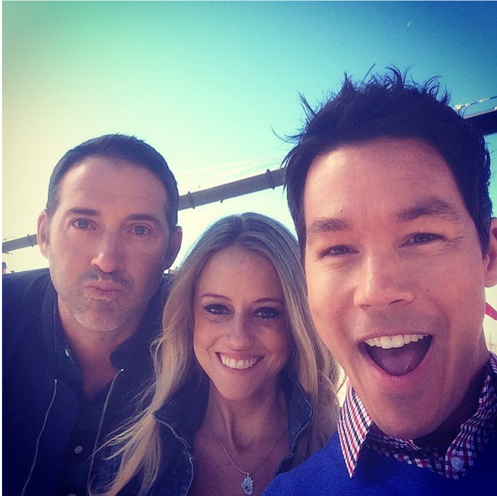
Beach Flip's Josh Temple, Nicole Curtis, and David Bromstad definitely mixed work and play.