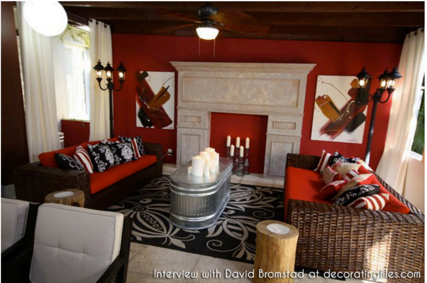
Interview with David Bromstad at decoratingfiles.com

3 – I want to build and design a home for myself and my partner from the ground up. On the water in Miami, of course. Super chic and gorgeous! Definitely one of my top bucket list wishes.