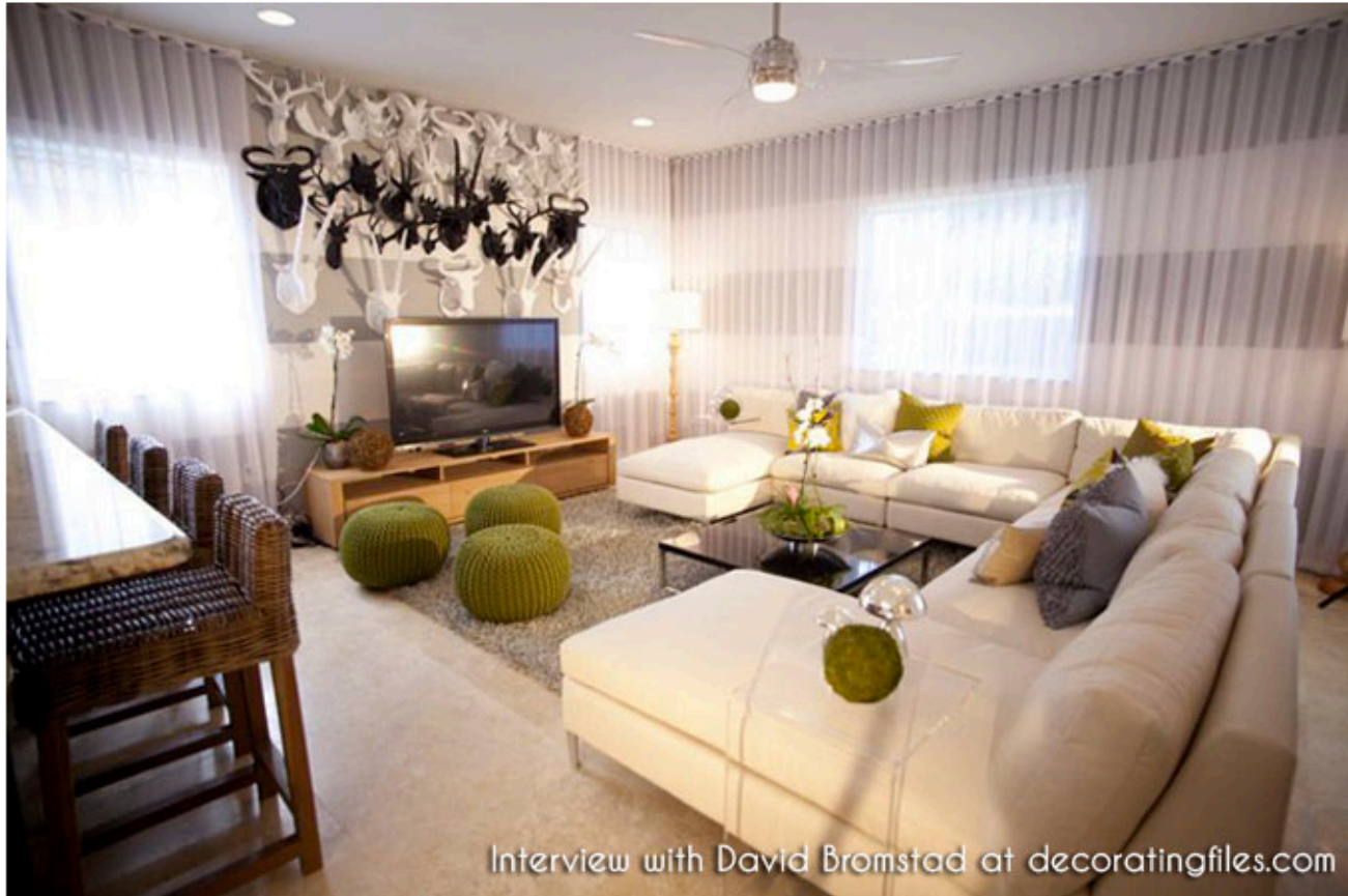
Interview with David Bromstad at decoratingfiles.com

I love being able to take my vision for a space and make it a reality. When it all comes together, it's amazing. What I like least is the time it takes to obtain certain materials for a project. Some of the items I order are from overseas, some out of stock. It really puts some stress on the entire project, especially the homeowners.