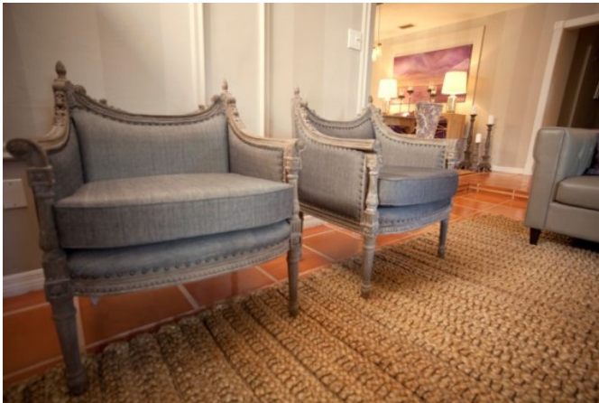
Muted colors and exquisite furniture offer a delicate Parisian feel!