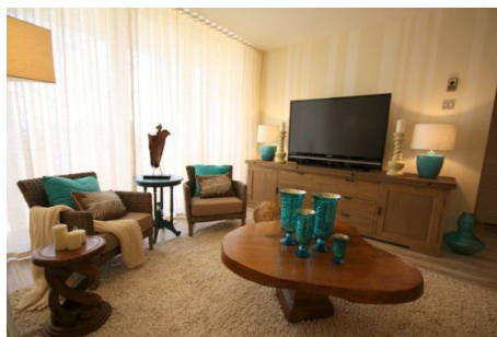
Pops of turquoise brighten this room!