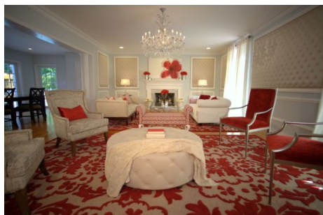
Stunning living space accented with a beautiful rug!