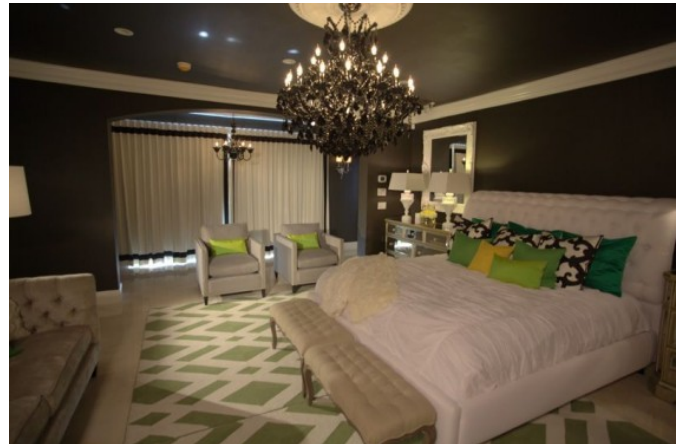
David added pops of color and glamour to this beautiful bedroom!