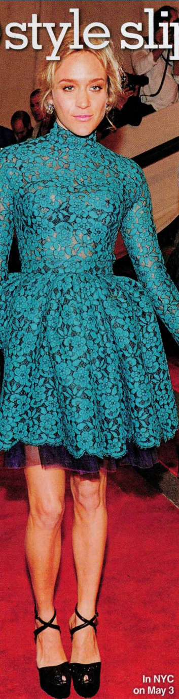
In NYC on May 3