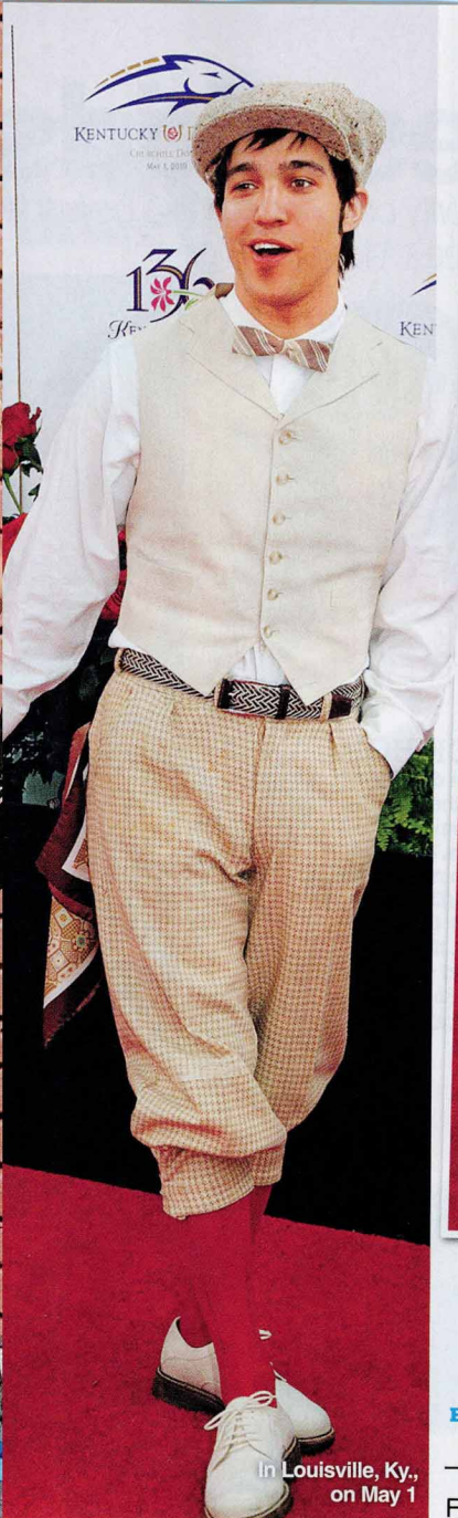
In Louisville, Ky., on May 1