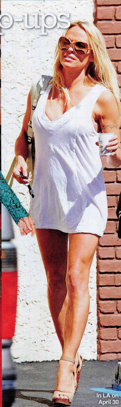
In LA on April 30